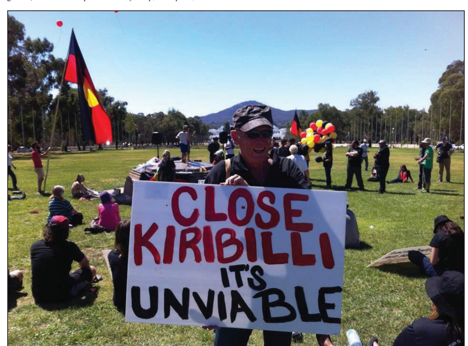
WHOSE LIFESTYLE? Demonstrators at Parliament House in March.

The challenge to deliver development and citizenship services to remote Australia is